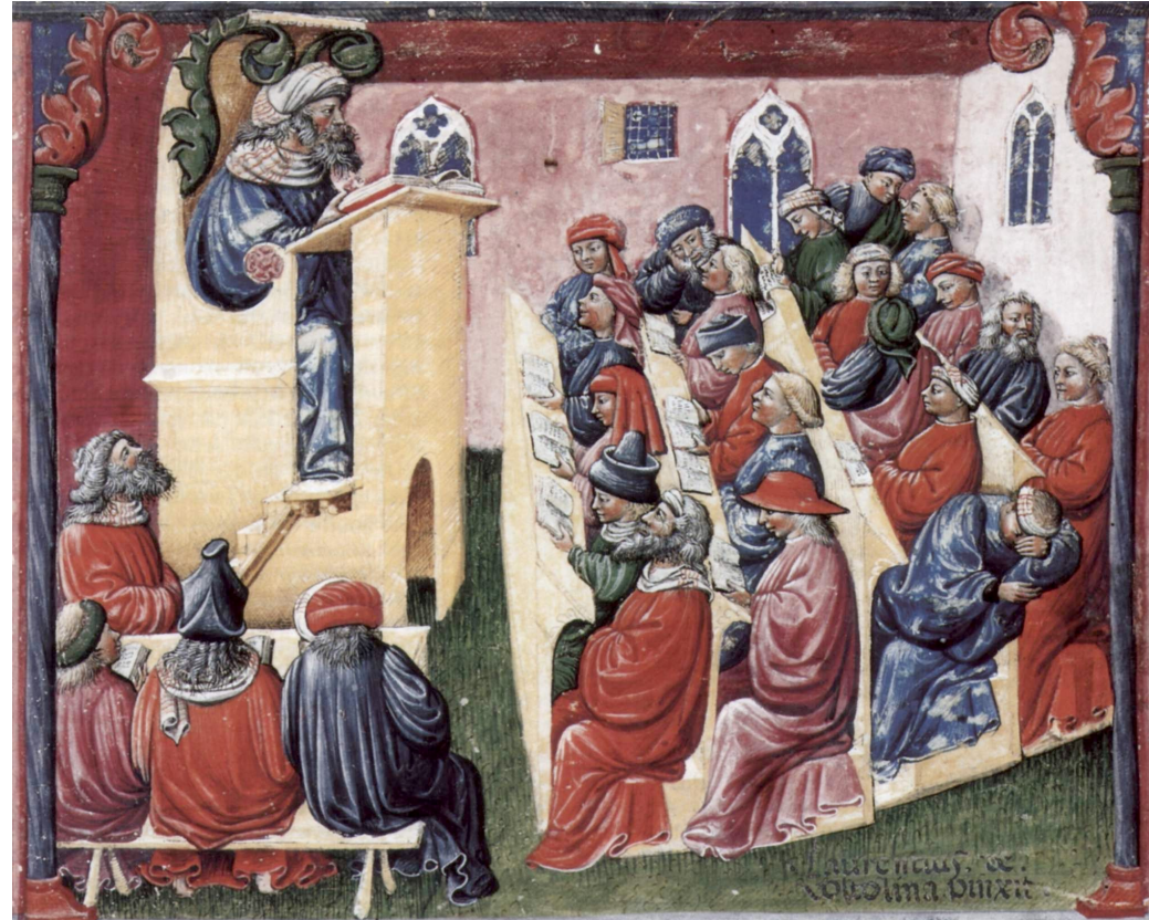
Laurentius De Voltolina, Liber ethicorum des Henricus de Alemannia, XIV century, School of Bologna