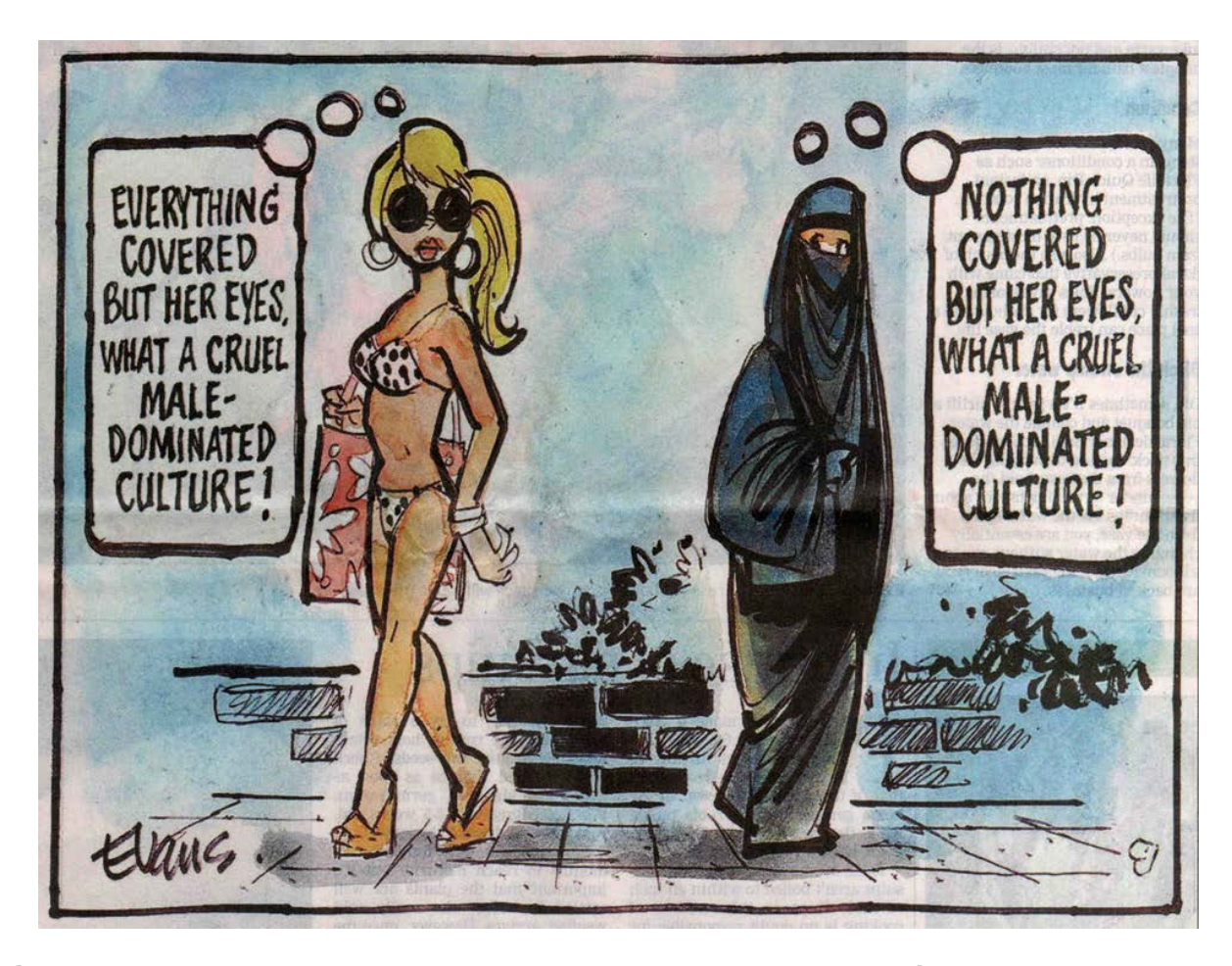
Caution when using own values as a reference point!