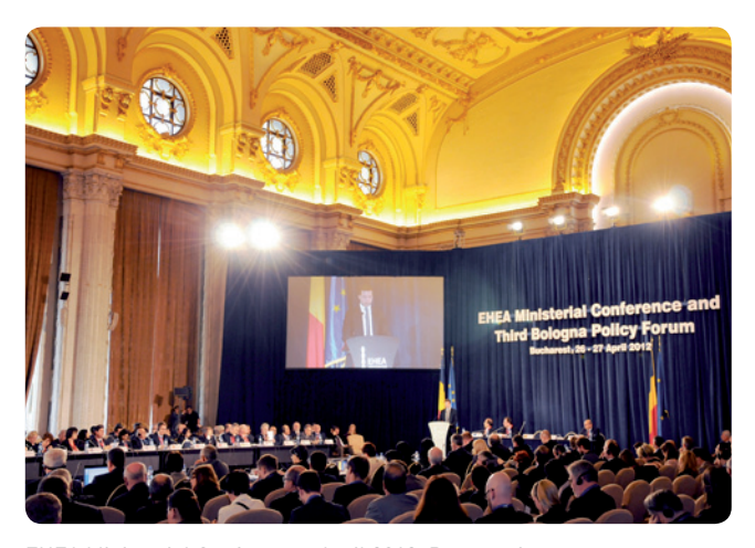
EHEA Ministerial Conference, April 2012, București

The Bucharest Communiqué commitment to allow EQAR-registered agencies to perform their activities across the EHEA is in line with the objectives formulated for EQAR at the outset, i.e. to: "provide a basis for national authorities to authorise higher education institutions to choose any agency from the Register, if that is compatible with national arrangements" (E4 Report to the London Summit, 2007). This objective has since formed a key element of EQAR's mission and strategic priorities.