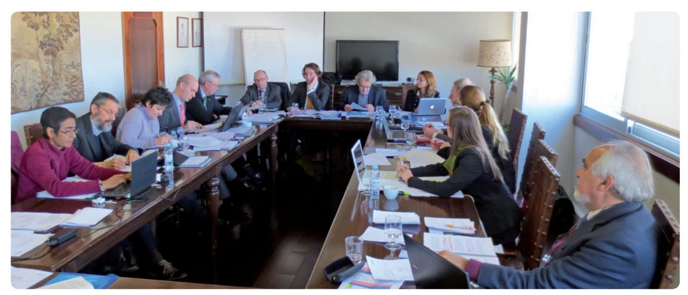
Register Committee, December 2012, Aveiro

situations where an agency's current practice differs substantially from the situation when it was reviewed against the ESG and admitted to the Register. However, only in cases of serious concerns about whether a registered agency continues to comply substantially with the European Standards and Guidelines (ESG) the Register Committee will consider further action, such as an extraordinary review of registration.