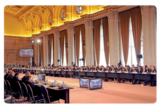
EHEA Ministerial Conference, April 2012, Bucuresti

Ministers further asked EQAR to cooperate with the E4 group, Education International and BUSINESSEUROPE in the revision of the European Standards and Guidelines (ESG, see 2.3 below).