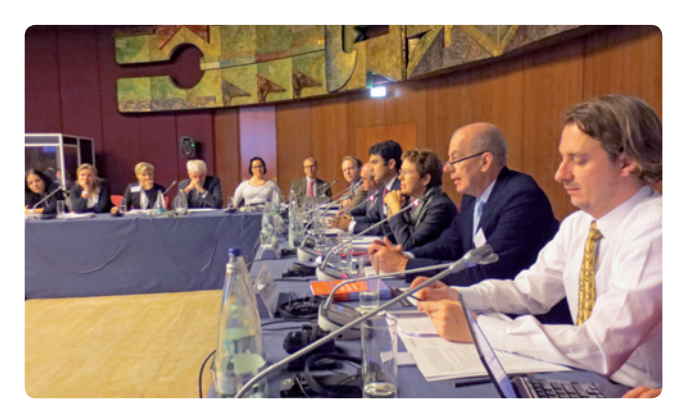
Members' Dialogue, October 2012, Bucuresti

The analysis will inform stakeholders and policy makers, and enable them to build on experiences from different EHEA countries.