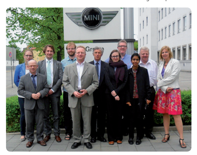
Register Committee, May 2012, München

At its meeting on 1 December 2012, the Register Committee considered the progress of the ESG Revision and commented on draft documents under discussion in the Steering Group.