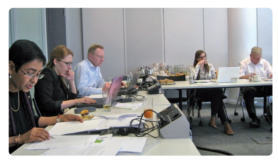
Register Committee, May 2012, München

Whereas eligibility was so far only officially verified once an application was made, a new process is now available to determine an agency's eligibility before it undergoes an external review and makes an application. This will avoid situations where an agency undergoes an external review without being able to use that review in the end.